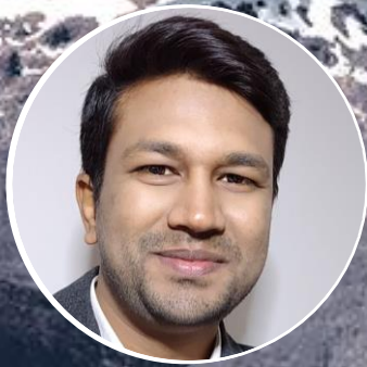
Wasim Akram Pathardehleez