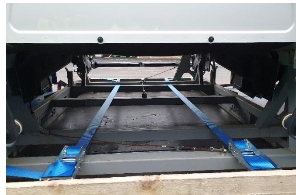
Rear – S cabs