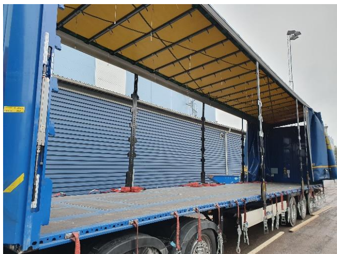
Left side, roof heightened to max