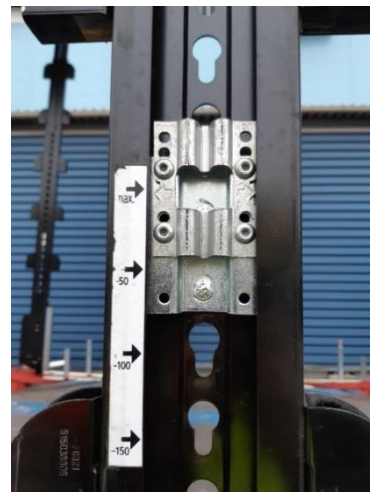
Pole, extended to max