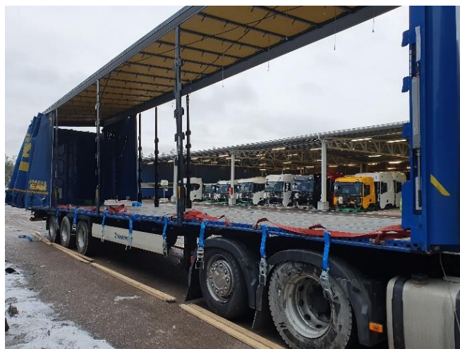
Right side, prepared with buckles