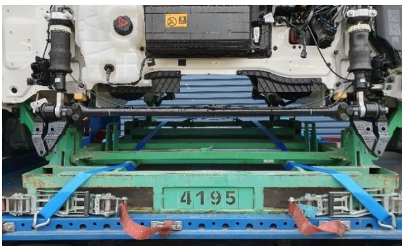
Front – P and G cabs