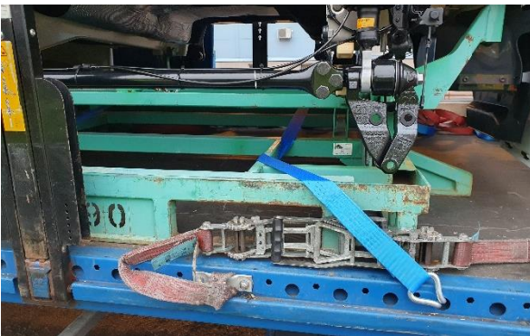
Front – R cabs