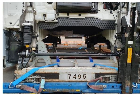
Front – S cabs