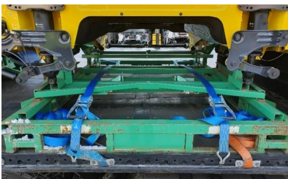
Rear – P, G and R cabs